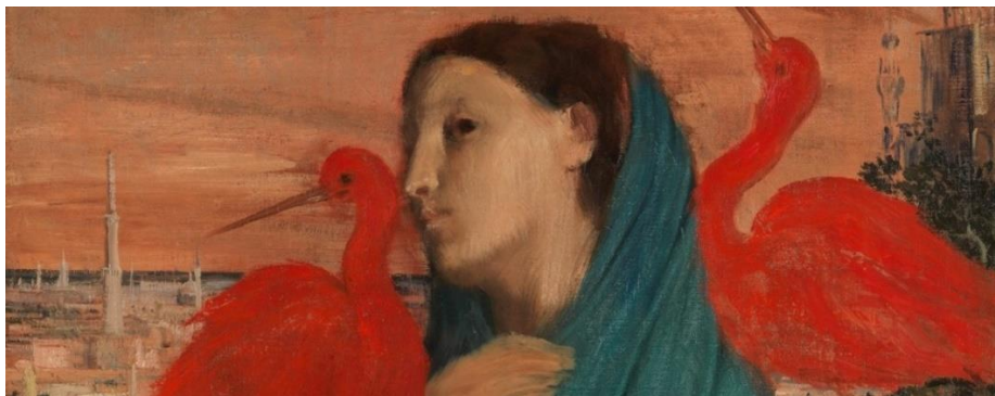
Edgar Degas, young woman with an ibis, 1857-58, The Metropolitan Museum of Art, New York

This exhibition, which brings together the two painters Édouard Manet (1832-1883) and Edgar Degas (1834-1917) in the light of their contrasts, forces us to take a new look at their real complicity. It shows the heterogeneous and conflicting nature of pictorial modernity and reveals the value of Degas's collection, where Manet took a larger place after his death.